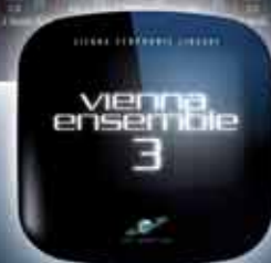
Vienna Ensemble User Interface: Mixing window with master bus, instrument group buses, and single instrument channels.