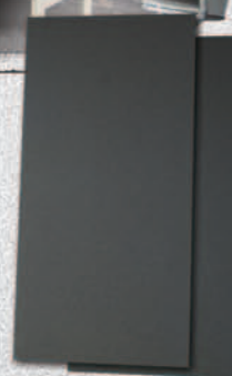
ELiTE™ CT45™ Bass Traps