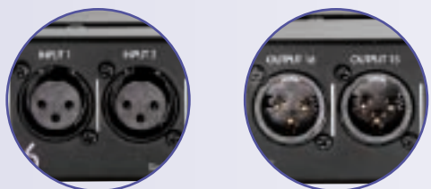
(female on front) XLR connectors (male on rear)

TPatch Eight Point Balanced Patch Bay The ARTcessories TPatch is a compact 8-point balanced patchbay that organizes your cables into a convenient central location on your studio desktop. Designed for maximum flexibility, the TPatch has 1/4-inch TRS phone connectors user selectable normal and half-normal modes.