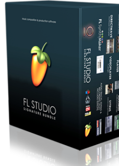
Image Line have released the latest version of their flagship music production suite FL Studio. The obvious choice for music producers from beginner to international superstars, FL Studio is the most affordable, fully fledged production tool available. With tens of thousands of dedicated users worldwide, FL Studio gives you all the tools you need to produce dance floor smashes and radio-ready hits in one place.

FL Studio 10 is a complete software music production environment, representing more than 12 years of sustained & focused development. Everything you need in one package to compose, arrange, record, edit, mix and master professional quality music. FL Studio 10 is the fastest way from your brain to your speakers.